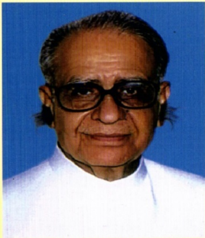
Sri TRILOKI NATH CHATURVEDI

His Excellency, The Governor of Karnataka