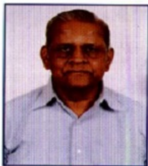
Dr. S. S. BADRINATH

Dr. Sengamedu Srinivasa Badrinath's name is synonymous with vision restoration. A doctor by profession, a humanitarian at heart, a small step taken by him has brought about a silent revolution, benefiting people by the lakhs.